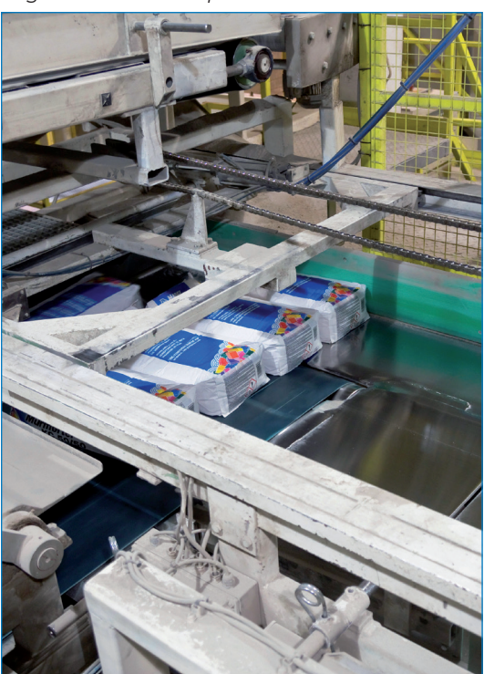
Figure 1: Production process detail

The production process starts from raw materials, that are purchased from external and intercompany suppliers and stored in the plant. Bulk raw materials are stored in specific silos and added automatically in the production mixer, according to the formula of the product. Other raw materials, supplied in bags, big bags or tanks, are stored in the warehouse and added automatically or manually in the mixer. The production is a discontinuous process, in which all the components are mechanically mixed in batches. The semi-finished product is then packaged, put on wooden pallets and stored in the finished products warehouse. The quality of final products is controlled before the sale.