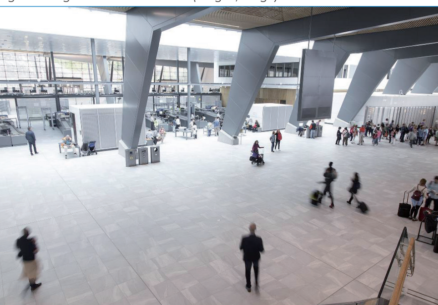
Figure 1: Bergen Lufthavn - Flesland (Bergen, Norge)